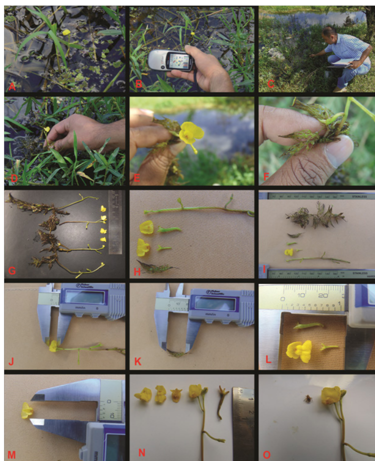
Figure 2 Collection and characterization of U. aurea Lour.