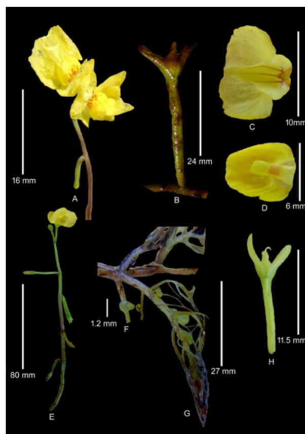
Figure 1 Characterization of U. aurea Lour.

The field work and literature survey revealed that the plant mostly found near the paddy fields. There were about 20 associate species enumerated belonging to 20 genera and 15 families (Table 2). It was observed that 4 associated plant species belongs to family Asteraceae. It was noted that U. aurea is mostly appeared in the canal and near the rain water stream in scattered yellow patches.